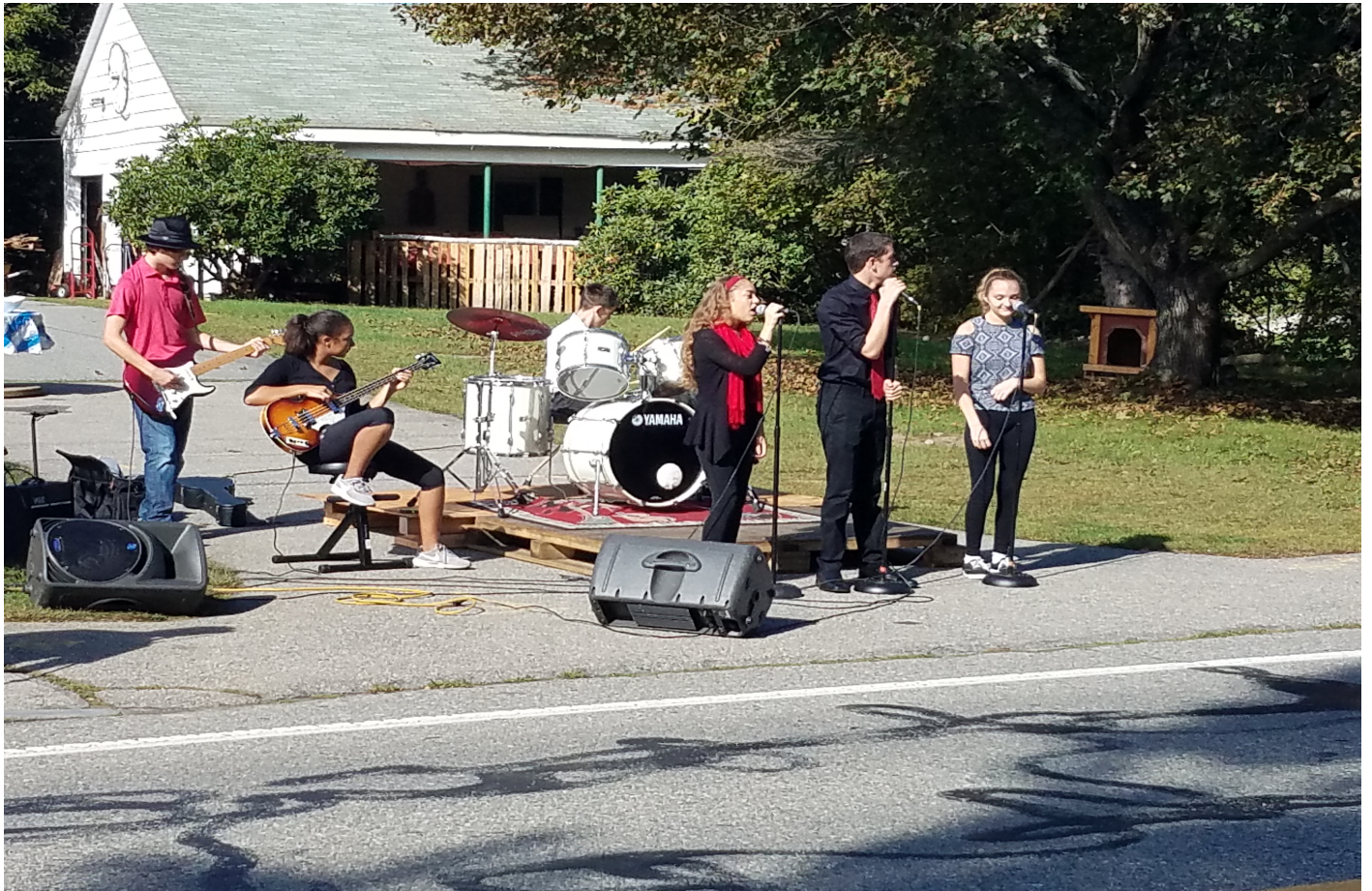
(Joseph Middlemiss Big Heart Foundation)